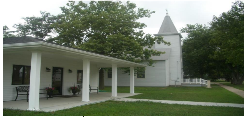
CONFESSIONS: 2<sup>nd</sup> Wed. of Month, Dec. 12, 4:45-5:15 pm