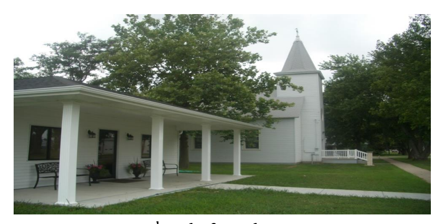
CONFESSIONS: 2<sup>nd</sup> Wed. of Month, Jan. 9, 4:45-5:15 pm MASS SCHEDULE AND INTENTIONS: